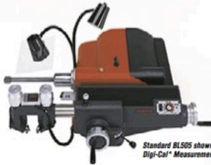
Standard BL505 shown with optional Digi-Cal® Measurement Caliper.